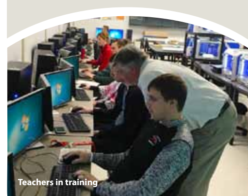
Teachers in training