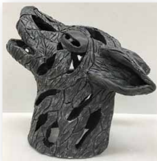
Rebecca Waupoose, "Into The Night"